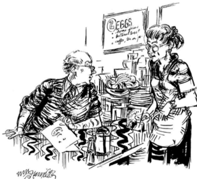
"Ranch, creamy Italian, French, or global?"