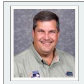
UF's Gardening in a Minute wins silver award